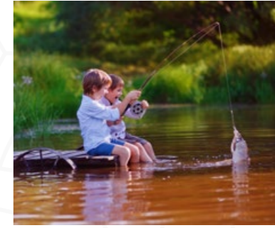
Nature takes pride of place at the Green Zone. But it's just as blissful by the fishing lake or make new friends at the stables, petting farm and dog park.