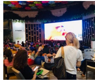
Spend lively afternoons at the events park, sample something new at the outdoor food market or host a barbecue by the lake as you camp out for the night..