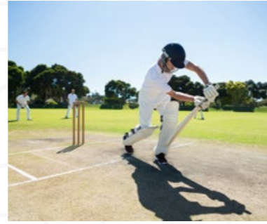
There's everything to play for with world-class venues and facilities for tennis, football, cricket, volleyball, basketball and other sports.